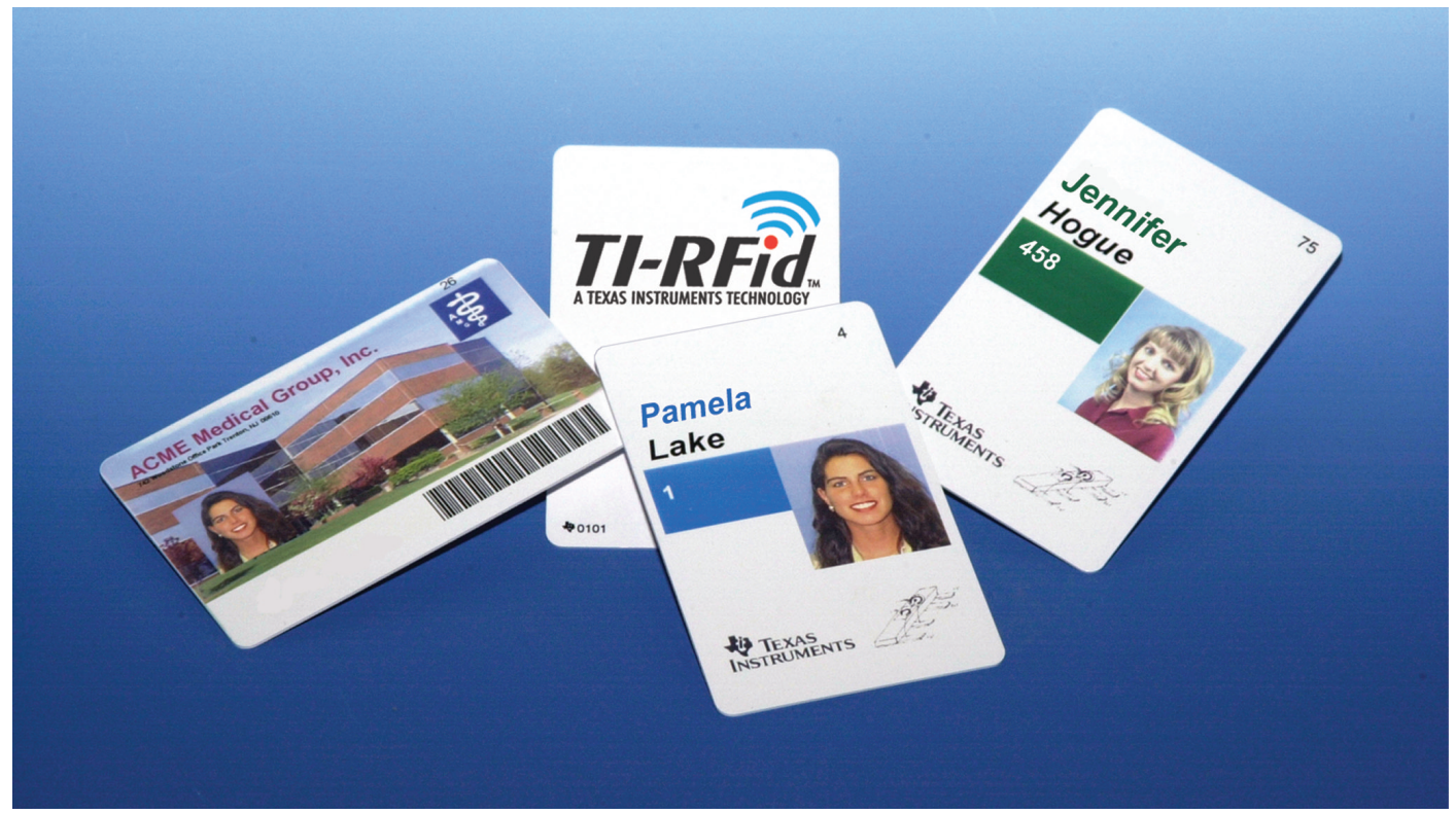
TI-RFid 13.56 MHz Vicinity badges (print examples)

The badge is available in two versions (with/without magnetic stripe) and can be easily customized and personalized using standard thermal transfer printers. Where the card needs to be used with a clip, a hole can be punched in the specificied area (see drawing). Additional options including encrypted custom data programming and slot punching will be available.